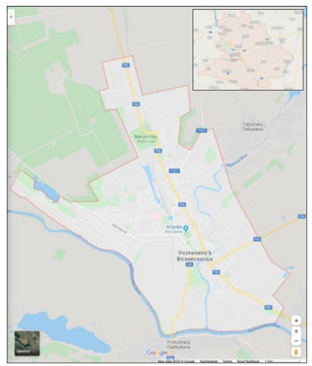
Note: Top picture inset is the city within Voznesensk rayon.

Administrative limits of the city of Voznesensk